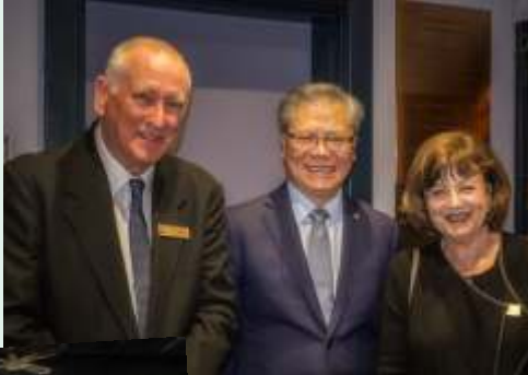
Below: The Governor and his Aide