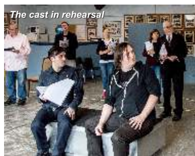
The cast in rehearsal