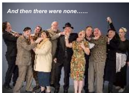
And then there were none.....