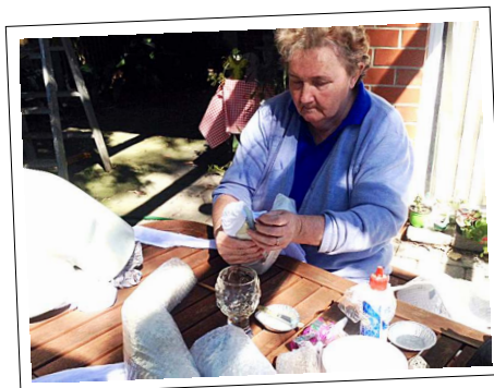
■ Ushmo making body parts

Our final show for 2014 is the hilarious story of three brothers, two Kosovan refugees, one bag of body parts and an assorted bunch of decidedly oddball characters.